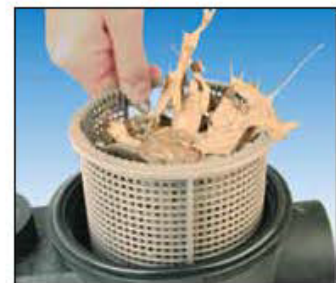
Super II 155-Cubic-Inch (2500cc) Basket

is more like a bucket. The Super II Pump Series features impressive leaf-holding capacity. Rigid construction includes load-extender ribbing for free-flowing operation, even under extra-heavy debris loads.