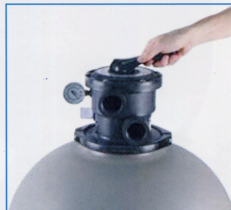
Vari-Flo™ 7-Position Control Valve with easy-to-use lever-action handle lets you "dial" any of seven valve/filter functions.