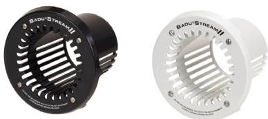
Optional round covers available in the colors black, gray, and white.

Consult your physician before attempting any strenuous exercise. This product may not be challenging or satisfying for all levels of exercise.