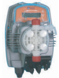
CTRL4 / CTRL7 / CTRL20